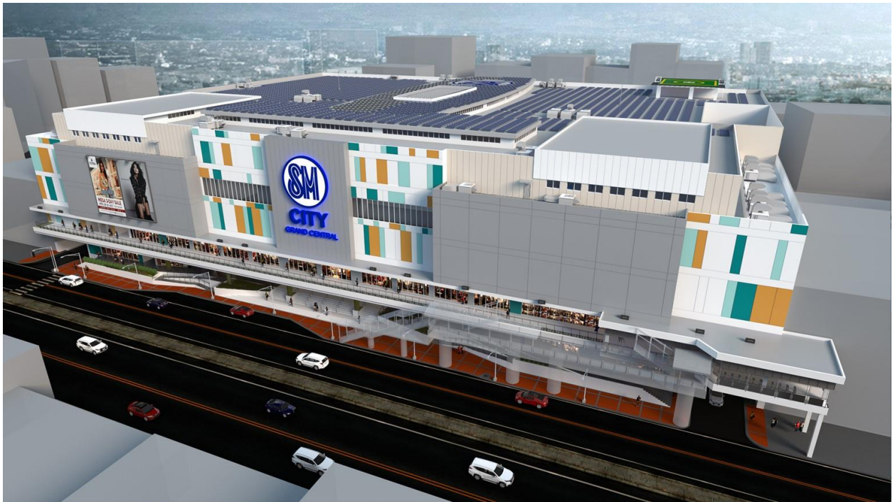
Artist's Rendition of SM City Grand Central in Caloocan City

(24 November, 2021, Pasay City) SM Prime Holdings, Inc. (SM Prime), one of the leading integrated property developers in Southeast Asia, is scheduled to open SM City Grand Central on November 26 th , Friday. This latest development will add more than 116,000 sqm of gross floor area (GFA) in the Company's mall portfolio providing six levels of retail spaces meant for a whole new level of shopping, dining, entertainment and recreational experiences in the City of Caloocan.